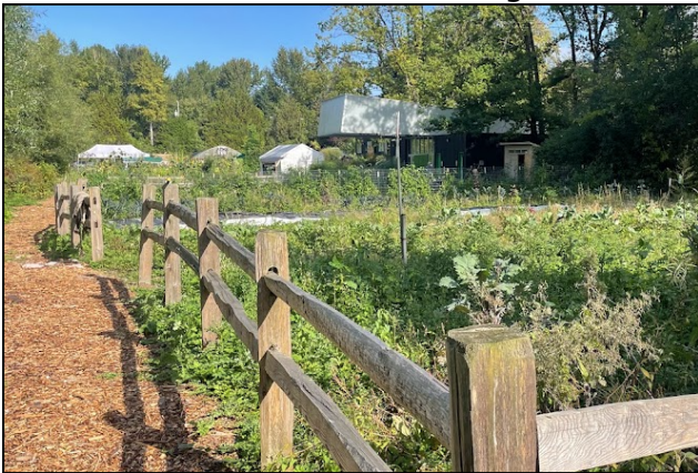
Rainier Beach Urban Farm