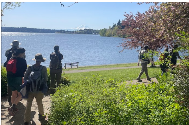
Towards Seward Park – Photo Peter Hendrickson

Note: The route is stroller friendly along the standard route with no sandy beach transits.